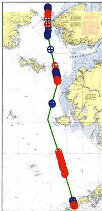
Figure 10: Depth differences in excess of 12ft as compared between existing nautical chart depths and updated hydrographic survey of the proposed route. Red indicates depths shallower than charted and blue indicates deeper depths than charted.