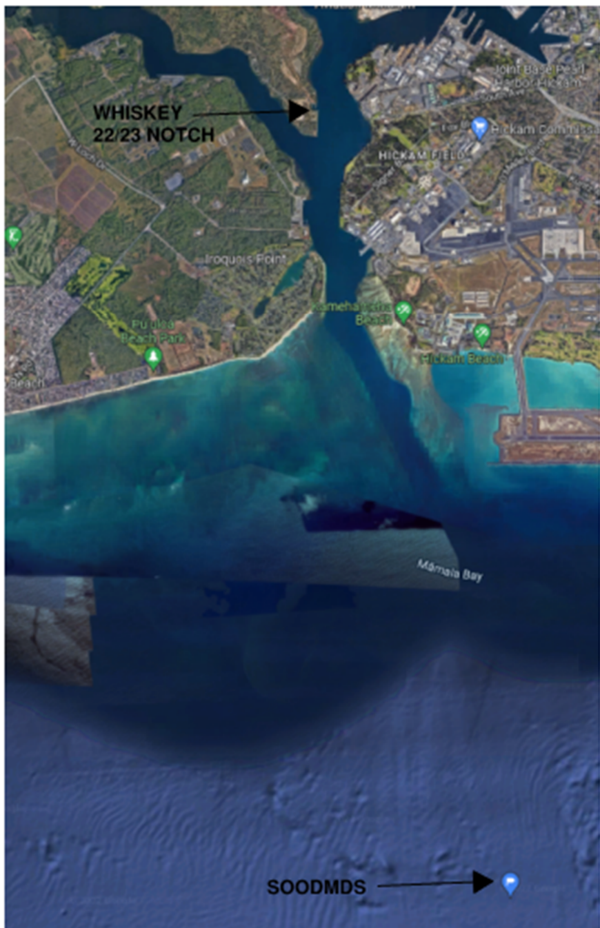
Figure 1: Site Map